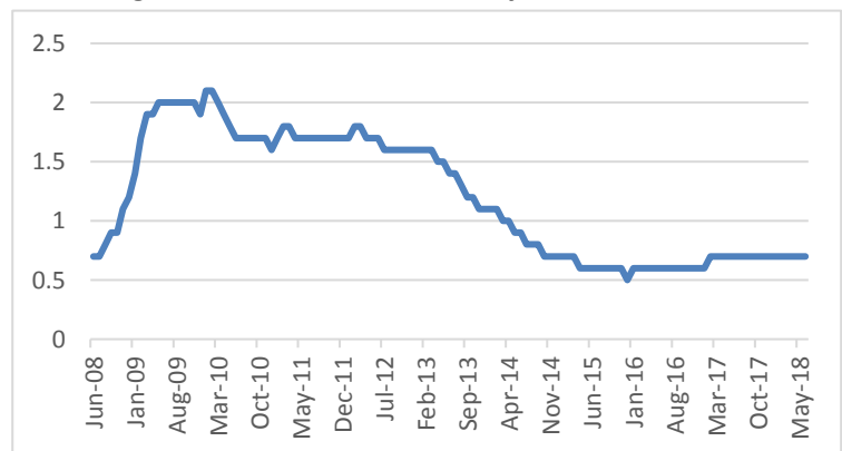
Figure 2: JSA claimants, Surrey, June 2008 – June 2018

Unemployment has increased from a recent low of 0.5% (3,925 claimants) in December 2015 but remains low by historical standards. Figure 2 (below) shows the number of JSA claimants in Surrey from June 2008 to June 2018.